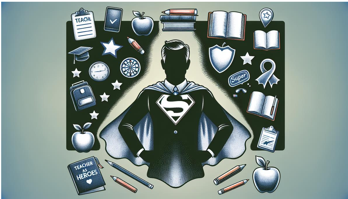
Teachers are heroes for students.