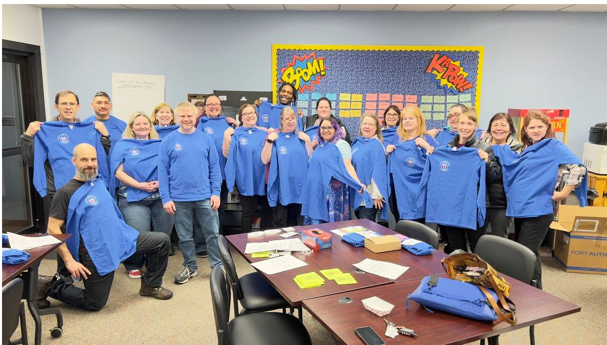
Some of your amazing FEA Building Reps. - representing you and our profession.