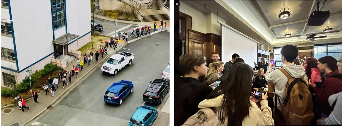
Students walkout in Juneau, April 4, 2024

This message finds you a day later than intended because I was sick with whatever virus has been going around. Ughhh. When I started planning this, I had a different topic in mind to share with you — and then yesterday, the students in Juneau, Sitka, and Homer arrived. Students in Juneau marched to the capital and made their voices heard in the House Finance Committee. Other students walked out elsewhere for 40 minutes - representing the 40 votes needed to override Governor Dunleavy's veto of SB 140. Other students across the state communicated their concerns and frustrations with the Prioritize My Education photos being shared with legislators.